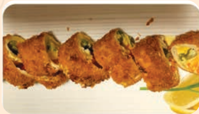
CHICKEN CHEESE ROLL