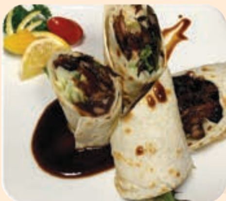
CRISPY DUCK ROLL