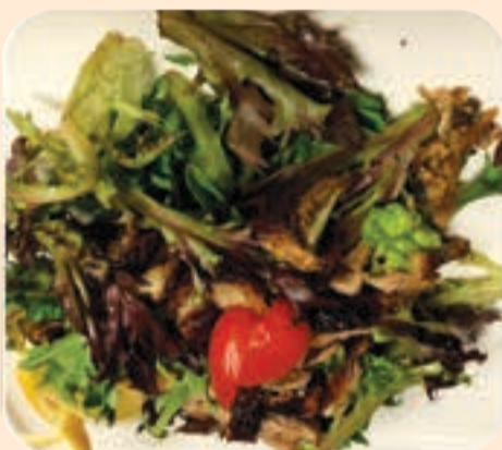
ROASTED DUCK SALAD